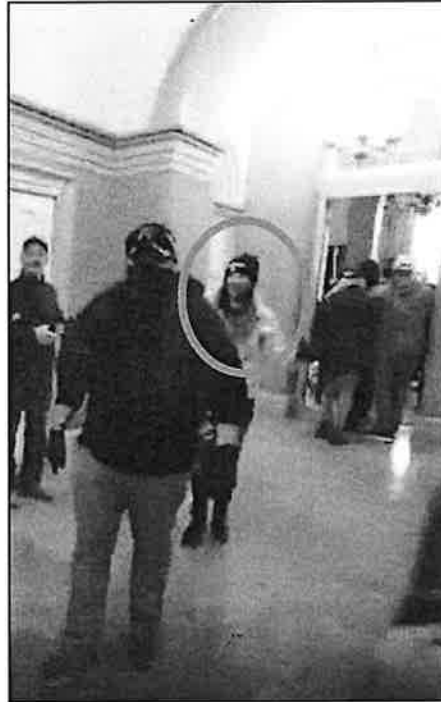
The defendant (in blue), with Llamas, walking away from the Senate Spouses' Lobby

11. The defendant walked out of the Senate Wing Door at 3:17 p.m. After leaving, the defendant saw people fighting with law enforcement outside the Capitol Building.