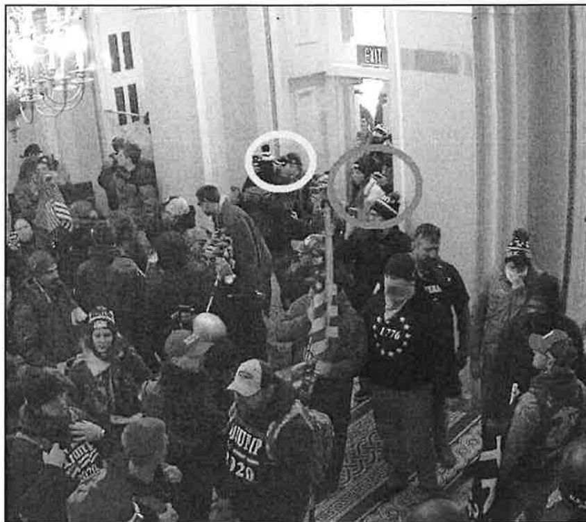
The defendant, circled in blue, with Llamas (yellow) entering the Senate Wing Door.

10. The defendant walked towards the Crypt and later walked away from the Senate Spouses' Lobby. The defendant decided to leave the Capitol after hearing from a law enforcement officer that the National Guard were coming to the US Capitol.