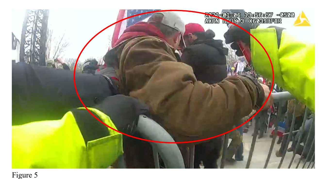
The subject then turned fully around to face the officers and grabbed the barricade with both hands: