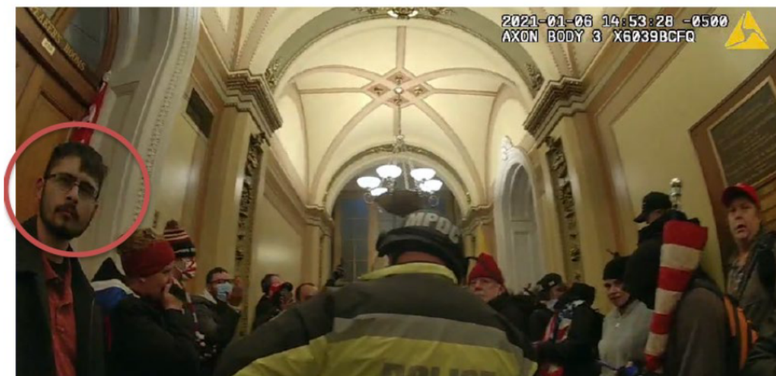
Exhibit 2 – MPD Body Worn Camera (BWC)