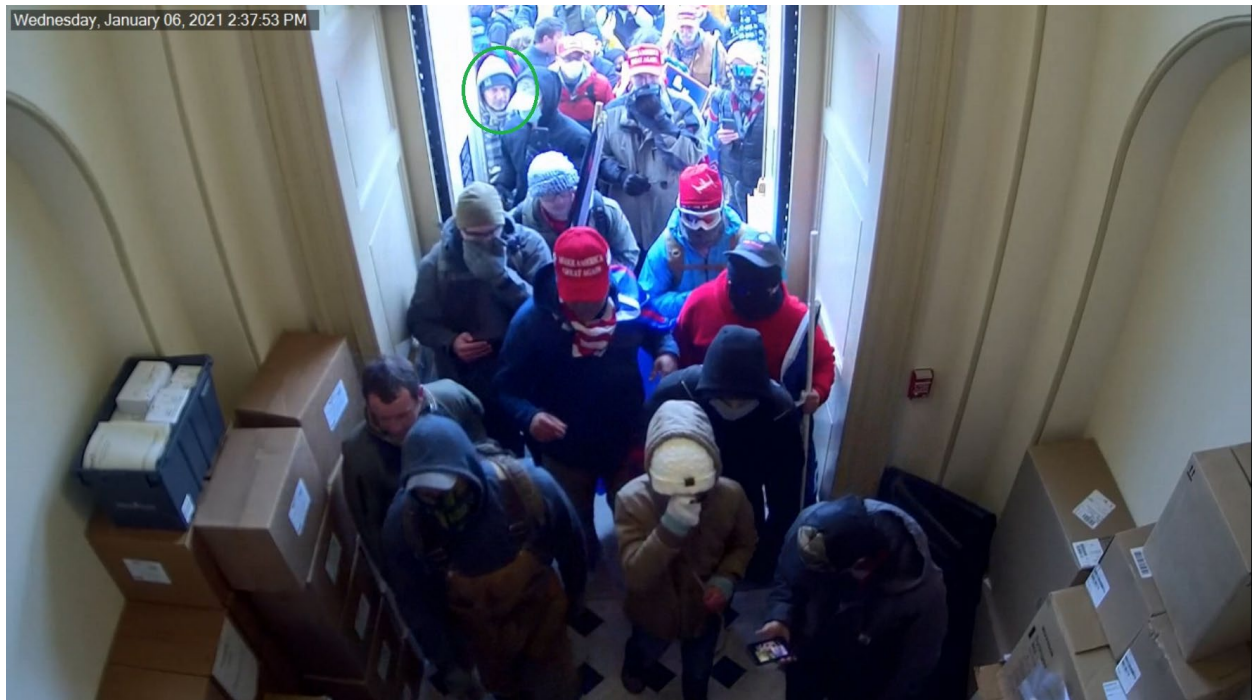
Images 10 and 11. Exhibits 17a and 17b, screenshots from Exhibit 17 at 17:44 and 17:53.