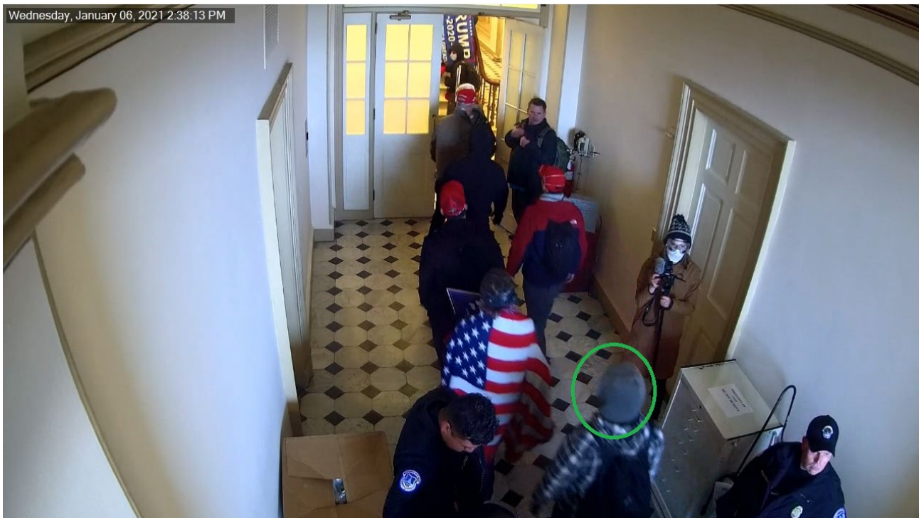
Images 12 and 13. Exhibits 18b and 18c, screenshots from Exhibit 18 at 17:59 and 18:13.