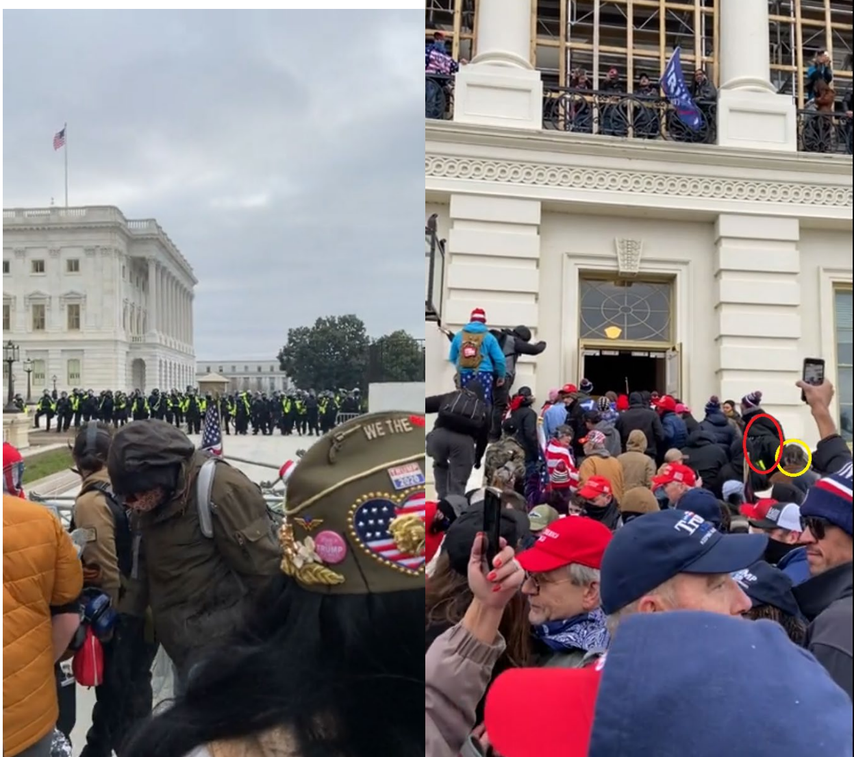
Images 6 and 7. Exhibits 15a and 15b, screenshots from Exhibit 15 at 0:58 and 1:15.

The Cantrells moved south on the Upper West Terrace, past the broken police barriers identified in Image 4. Their path was blocked by a makeshift barricade, beyond which was a line of police officers in riot gear. A video from a rioter shows the barricade, police, and then pans to the left to show the Cantrells ascending the stairs toward the Upper West Terrace door (the “UWT door”) where they entered the Capitol building.