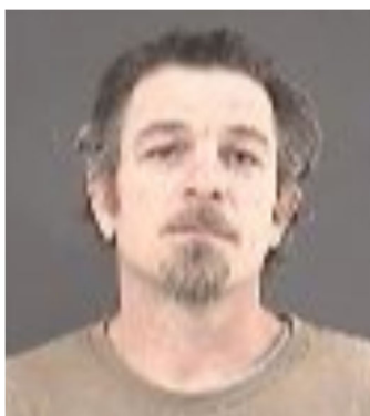
Image 4, 2020 Booking Photo