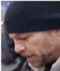
Image 1 – Photograph of AFO-324 from FBI website ( https://www.fbi.gov/wanted/capitol-violence-images/capitol-324a.jpg/view )

The FBI is seeking to identify individuals involved in the riots at the U.S. Capitol on January 6, 2021, including those who assaulted federal law enforcement officers. Call 1-800-CALL-FBI or visit tips.fbi.gov to submit information. Reference the assault on federal officer (AFO) photo number when calling or submitting information online. More at fbi.gov/capitolviolence