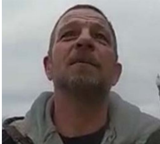
Image 17- cropped version of Image 3 – Screenshot of AFO-324 from D.C. Metropolitan Police Posting