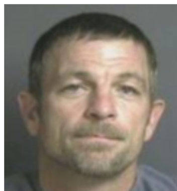
Image 5, 2017 Booking Photo