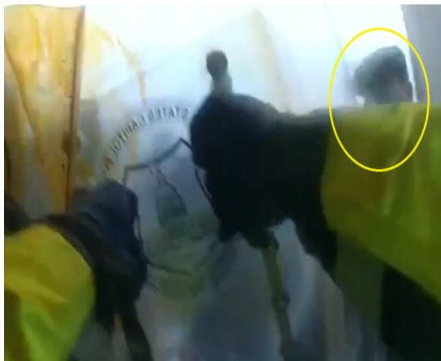
Figure 7: Officer-1 BWC

A review of BWC footage belonging to Officer-1 revealed that at approximately 4:46 p.m., DESJARDINS was observed assaulting Officer-1 using what appeared to be an object that resembles the size of a broken wooden table leg that is captured in the YouTube videos. Officer-1's BWC captured multiple strikes by DESJARDINS, including a strike at 4:47:25 p.m., shortly after another rioter threw a table at the officers. Officer-1's BWC footage corresponds with the YouTube videos mentioned above.