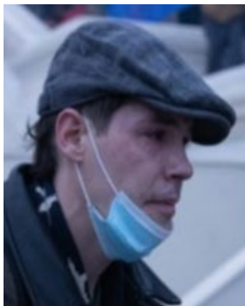
Figure 14: BOLO 348: https://www.fbi.gov/wanted/capitol-violence-images/348.png/view