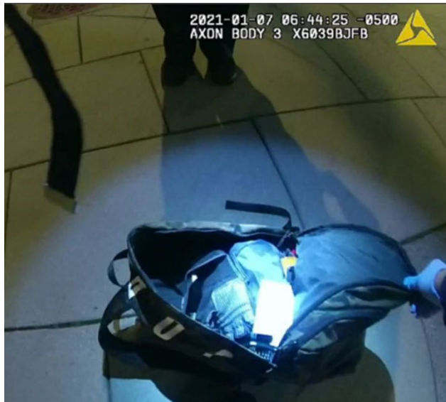
Figure 16: Officer-3 BWC