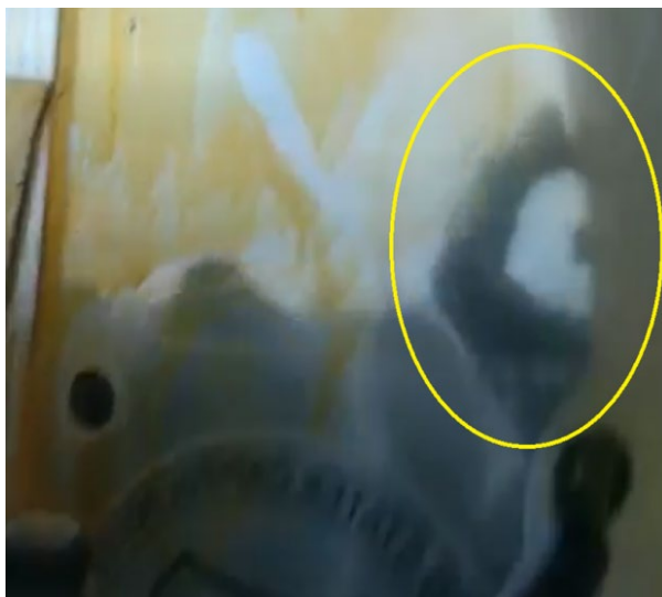
Figure 8: Officer-1 BWC