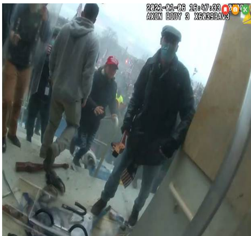
Figure 10: Officer-2 BWC

Near the time of the assault, Officer-1 was standing in close proximity to Officer-2. A review of Officer-2's BWC revealed DESJARDINS approaching the officers a second time with the broken table leg.