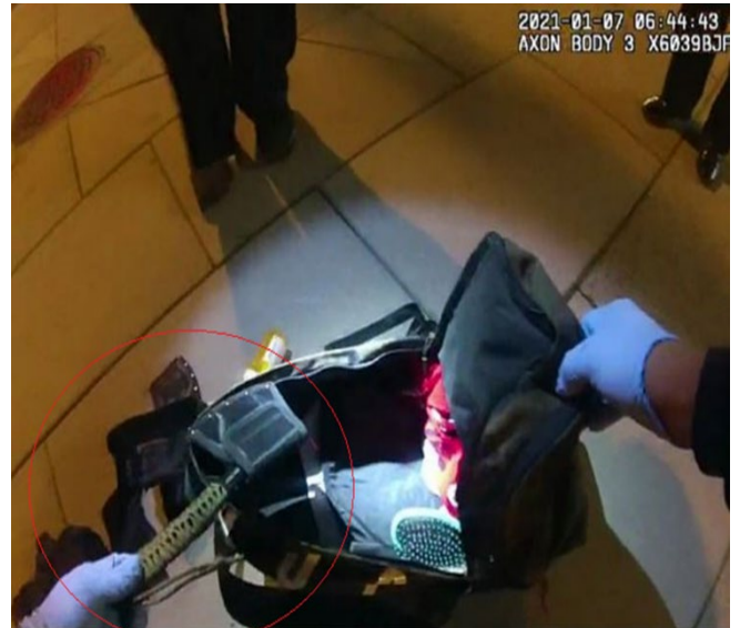
Figure 17: Officer-3 BWC