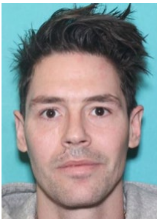
Figure 13: RI Drivers License Photograph