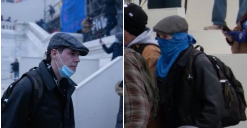
Figure 11: https://mobile.twitter.com/capitolhunters/status/1394002632797212673?lang=en