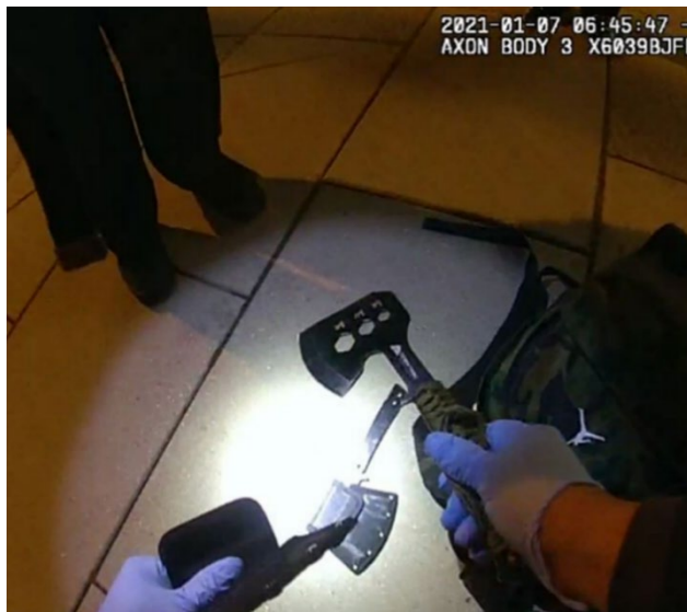
Figure 18: Officer-3 BWC