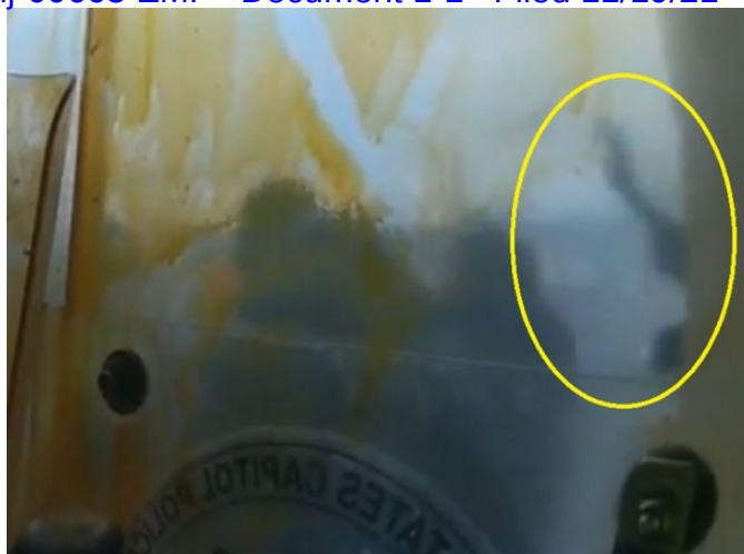
Figure 9: Officer-1 BWC

Near the time of the assault, Officer-1 was standing in close proximity to Officer-2. A review of Officer-2's BWC revealed DESJARDINS approaching the officers a second time with the broken table leg.