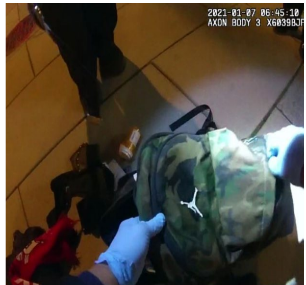
Figure 19: Officer-3 BWC