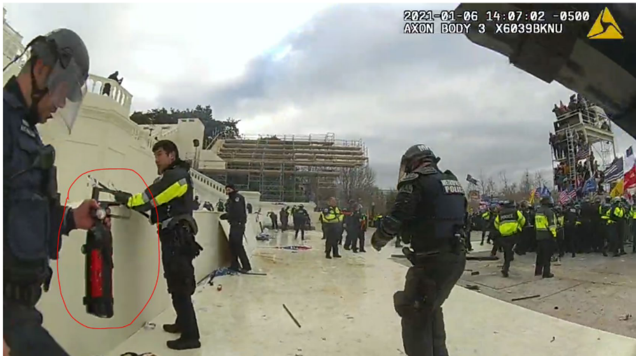
Figure 1: Officer Christopher Boyle's BWC at 2:07:02 p.m.

equipment; they are trained in how to deploy OC spray; they are sprayed with OC spray as part of their training; and they have deployed OC spray in the course of their duties as MPD officers. This experience is sufficient to enable them to provide certain limited opinions relating to whether the OC spray canisters at issue were consistent with those issued to MPD officers and whether the substances that were sprayed on them on January 6, 2021 was consistent with their prior experience. Furthermore, the canister that Schwartz used and possessed on January 6 is distinctive: it is a large, red and black item the size of a small fire extinguisher, with a nozzle on one end and a handle extending perpendicular from the barrel. These distinctive characteristics lend themselves to identification. Below is a still shot of an MPD officer holding such a canister on the Lower West Terrace before the crowd broke the police line, along with a still shot of Schwartz holding a similar or identical canister: