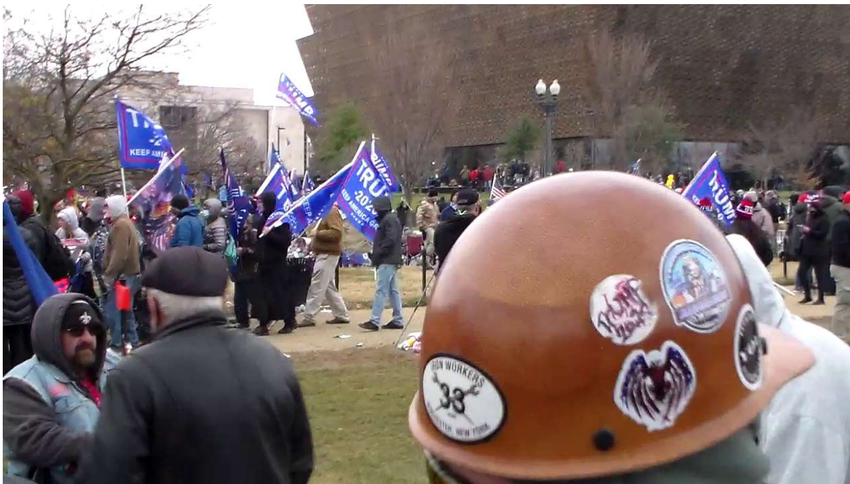
Figure 2: Mault, wearing a hardhat, before he and Mattice approached the Capitol building.