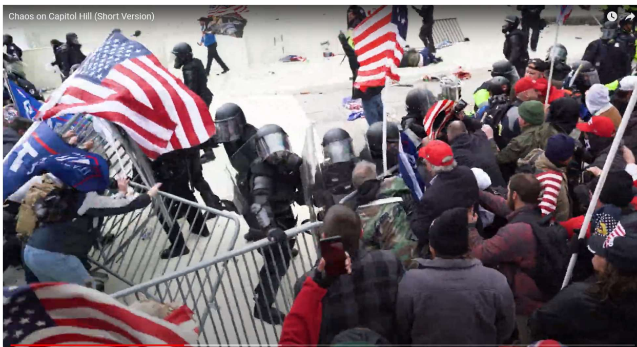
Figure 6: Seconds later, the police line collapsed. Mault and Mattice are to the right, out of frame.