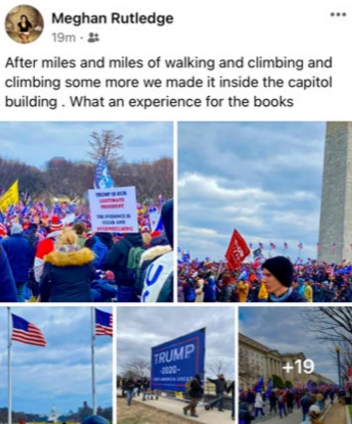
Image 10 is a post that Rutledge made to Facebook commenting on the defendant's breach of the Capitol.

On the night of January 6 th , a friend texted Rutledge and asked, "Hey lady! I see you were "boots in the ground" in DC today. I have a question... As the media obviously spews their own agenda on what they want us to believe. I'm curious about facts from someone there. You don't have to answer... But I'd rather ask someone who was there than believe the media." In a long response, Rutledge answered as follows: