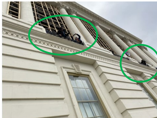
Image 6 is a photo taken at approximately 2:35 PM by Rutledge of rioters (circled in green) on the Capitol Building.

Besides the view from the scaffolding and the Northwest stairs of other rioters, there were other obvious signs not to enter the Capitol Building. Before breaching the Capitol, rioters were standing on ledges of the building directly above the Defendants.