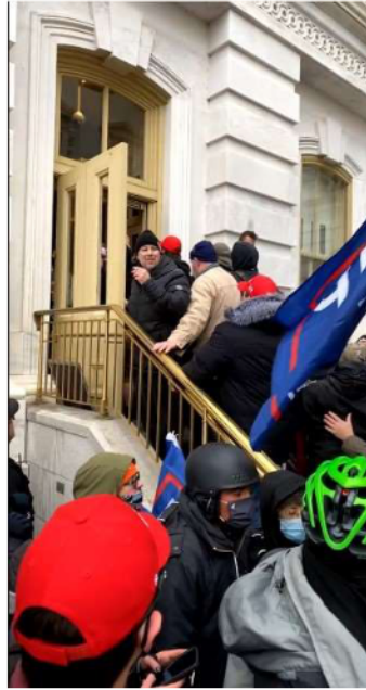
Parliamentarian (Fire) Door