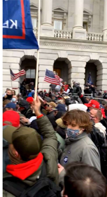
Senate Wing Door