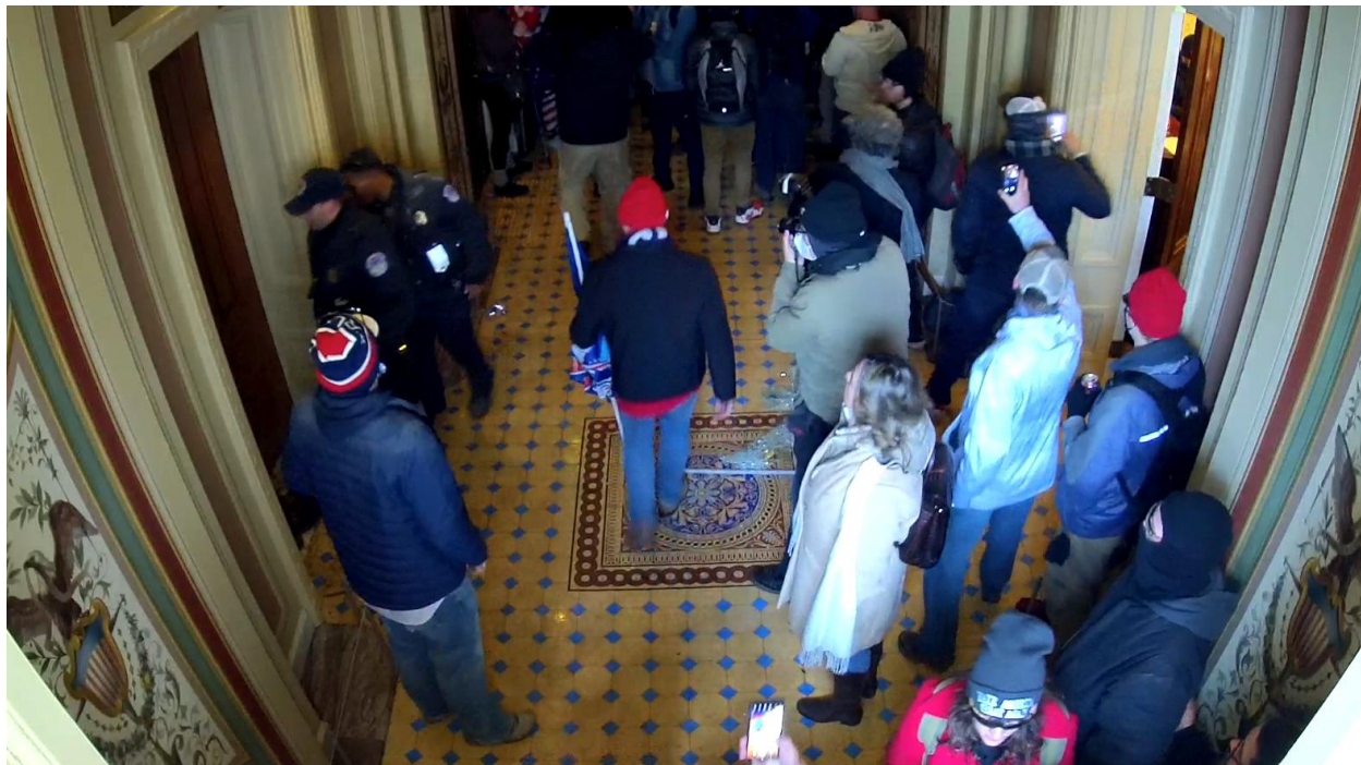
Defense exhibit 1: images taken from defense exhibit 2, CCTV video depicting an interior hallway immediately in front of the Parliamentarian Door on January 6, 2021, between 1:40 p.m. and 1:55 p.m.