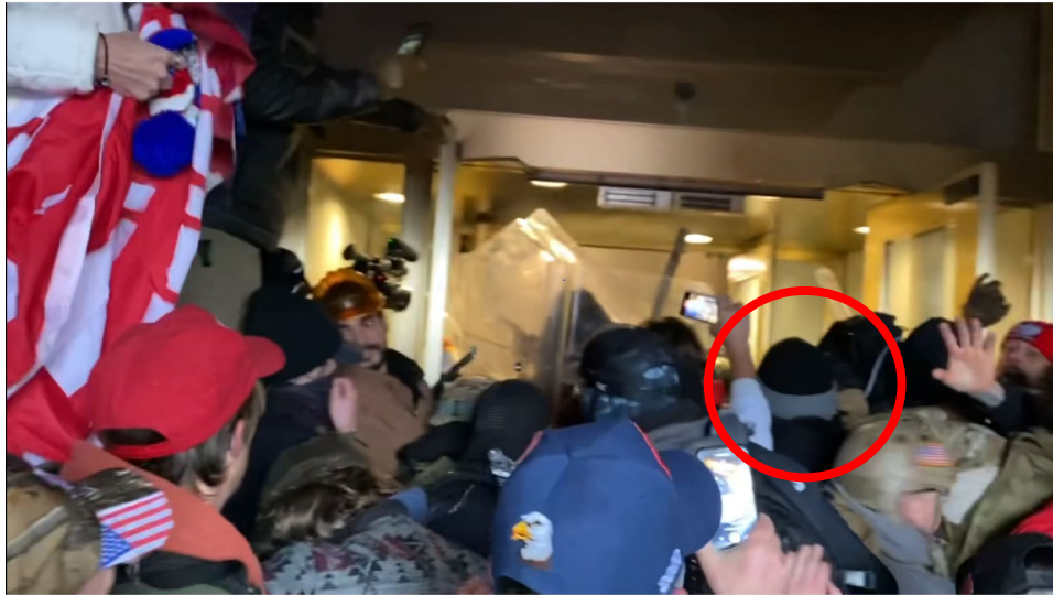
Still Shot from Exhibit 4: Political Trance video at 18:42

beleaguered police line. Exhibit 4, Political Trance, at 18:00 -18:30. It was then that Sibick rushed to the front, to add his weight to the pushing throng trying to enter the Capitol. See Exhibit 4, Political Trance, at 18:42; Exhibit 5, Defendant Cantwell Cellphone, at 5:22.