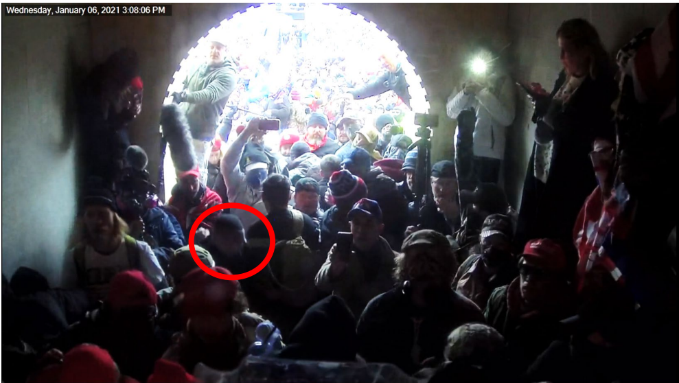
Still Shots from Exhibit 3: LWT Tunnel CCTV footage at 03:07:49 p.m. and 03:08:06 p.m.

The timing of Sibick's entry is significant; rioters inside the tunnel had just called for a "shield wall," comprised of stolen police riot shields, which they turned on the members of the