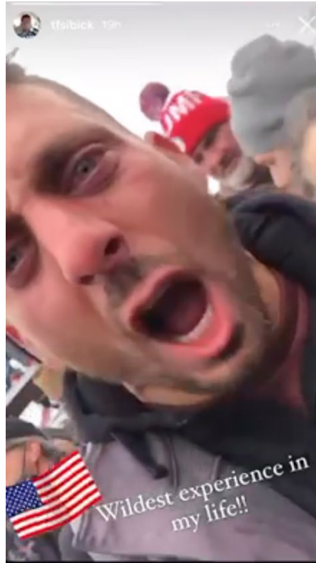
Still shots from Exhibit 1: Sibick Instagram Video at 00:10 and 00:22

Sibick also posted a photo to Facebook of himself holding a police riot shield.