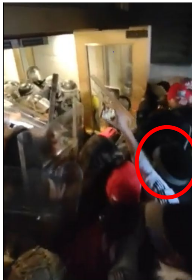
Still Shot from Exhibit 5: Defendant Cantwell video at 5:22

After a few minutes pushing at the front of the police line, Sibick turned around, moved to the mouth of the tunnel, and exited around 3:11 p.m. See Exhibit 3, at 3:10:55 p.m.