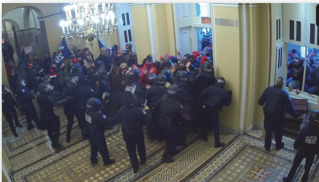
IMAGE 5 and IMAGE 6 —Screenshots from USCP surveillance showing the Senate Wing Door when the first breach was contained at approximately 2:27 PM and when the second breach occurred at approximately 2:48 PM on January 6, 2021.