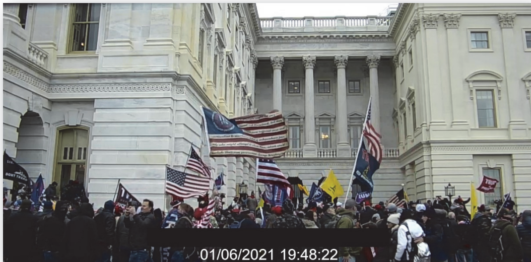
IMAGE 4 —A screenshot from USCP surveillance showing the NW Plaza at approximately 2:48 PM on January 6, 2021.