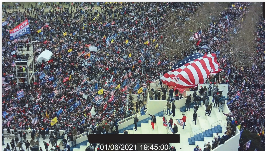
IMAGE 2 —A screenshot from USCP surveillance showing the Inaugural Stage, the Lower West Plaza, and the West Lawn at approximately 2:45 PM on January 6, 2021.