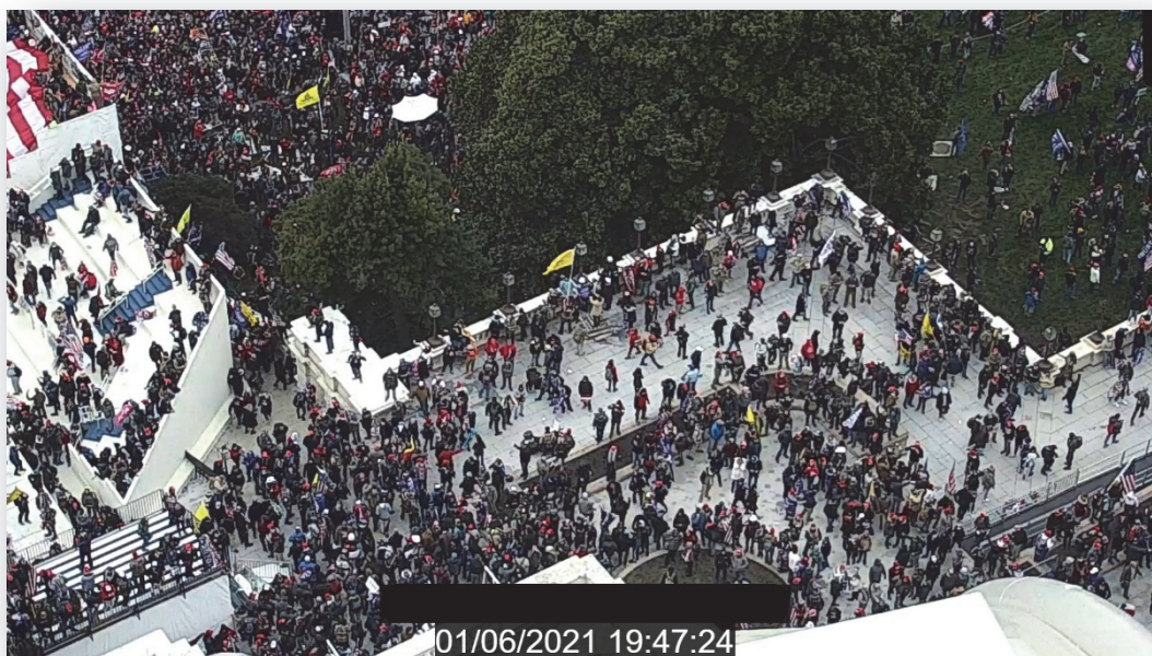
IMAGE 3 —A screenshot from USCP surveillance showing the NW Lawn and the NW Plaza at approximately 2:47 PM on January 6, 2021.