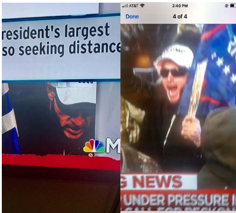
"News Photo 1"