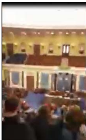
Screenshot of video provided by COMPLAINANT 1 as recorded by MALDONADO