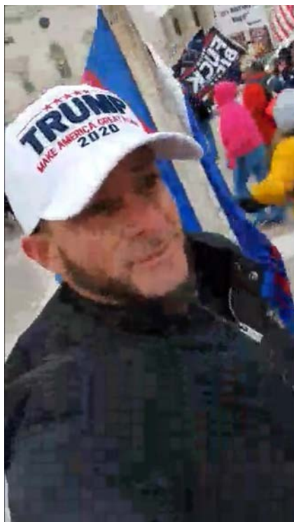
Screenshot of video provided by COMPLAINANT 1 of MALDONADO