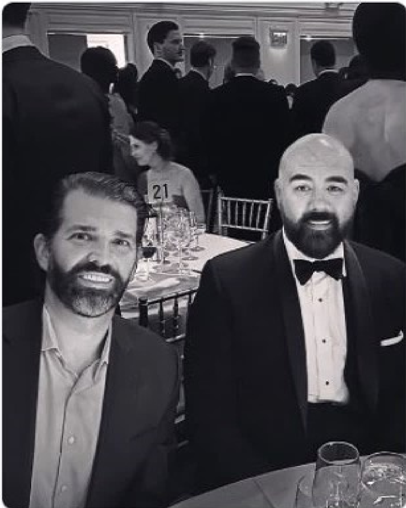
Donald Trump Jr.

You may not have had the chance to stand with JFK, but you do have a chance to stand with Donald Trump, and his persecuted supporters.