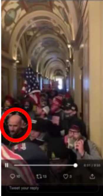
Figure 1 – screen capture from a Twitter account depicting Kelly and rioters near the North Door Appointment Desk.

Kelly and the others chanted, “Whose house? Our house.” See Ex. 1 – Twitter | gracyn_forever 5ff93adc86c51.video.mp4 (“Kelly Twitter video”), https://archive.org/download/nmu9xcmP9bo57SEGH/nmu9xcmP9bo57SEGH.mpeg4d ; see also Figure 1 above. 1 The officers tried to prevent them from advancing further into the Capitol, but they were overwhelmed. Kelly and the others made their way to the Senate chamber. See Figures 2 and 3.