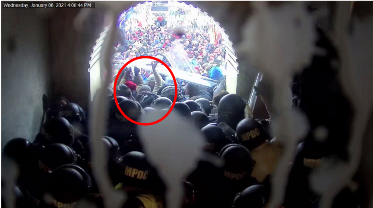
Figure 10: Ponder works with other rioters to pass a police riot shield forward.