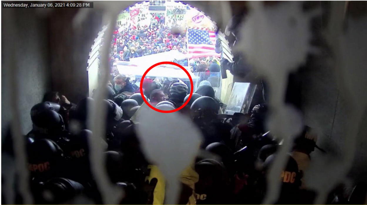
Figure 12: Ponder's face is visible under the riot shield.