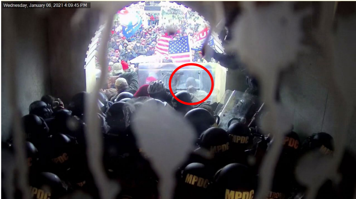
Figure 13: Ponder places the shield between himself and police.