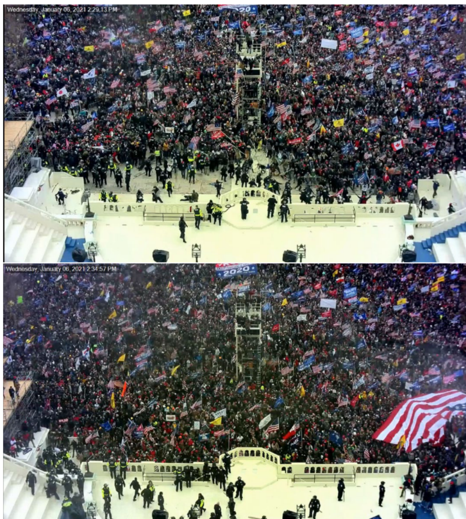
Figure 4: Breakthroughs in the defensive line on both the left and right flanks (top) caused the entire police line to collapse and individual officers were swallowed by the crowd (middle) and many officers were assaulted as they waited in a group to retreat through doors and stairwells up onto the inaugural stage (bottom).