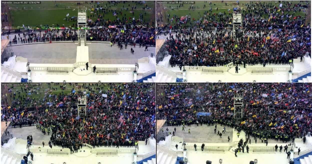
Figure 3: The breach of the West Plaza barricades (top left) was followed by the formation of a USCP officer wall (top right) until MPD officers arrived with bike rack barriers for a defensive line at the top of the West Plaza stairs (bottom left). In the photo of the nearly completed bicycle rack barrier line as of 1:39 pm, a large Trump billboard which would later be used against the police line like a battering ram is visible (bottom right).

The crowd continued to grow and, at 2:03 p.m., Metropolitan Police Department officers responding to USCP officers' calls for help began loudly broadcasting a dispersal order to the crowd. The dispersal order was clearly audible over the roar of the crowd.