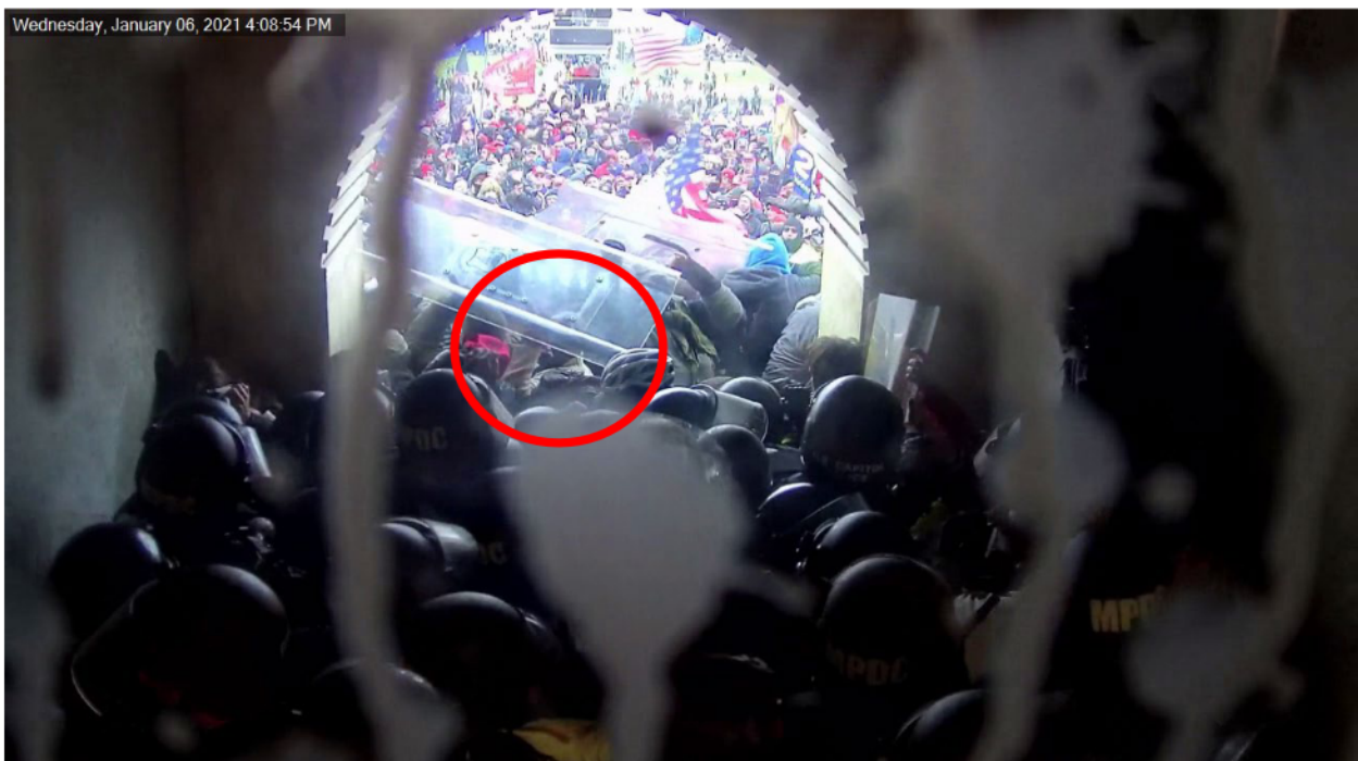
Figure 11: Ponder grips the riot shield and turns it toward the police line.