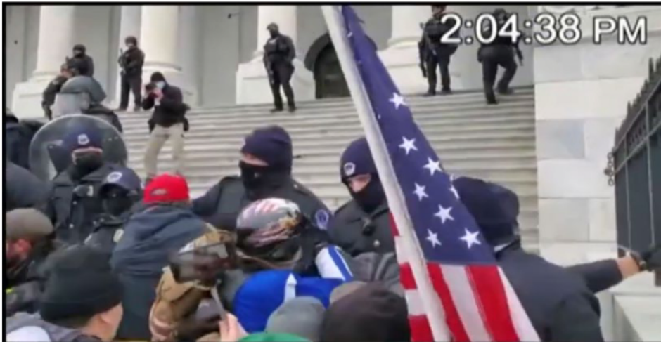
Photo No. 4 above is a screen shot from Exhibit No. 1 (upper right video) at approximately 2:04:38 p.m. Officers being confronted by rioters on the stairs.