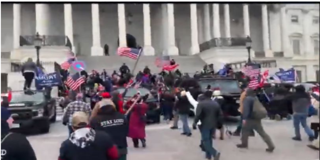
Photo No. 3 above is a screen shot from Exhibit No. 1 (lower left video) at approximately

Rioters then swarmed the base of the stairs. Id. Officers were assaulted. Id. (upper left video).