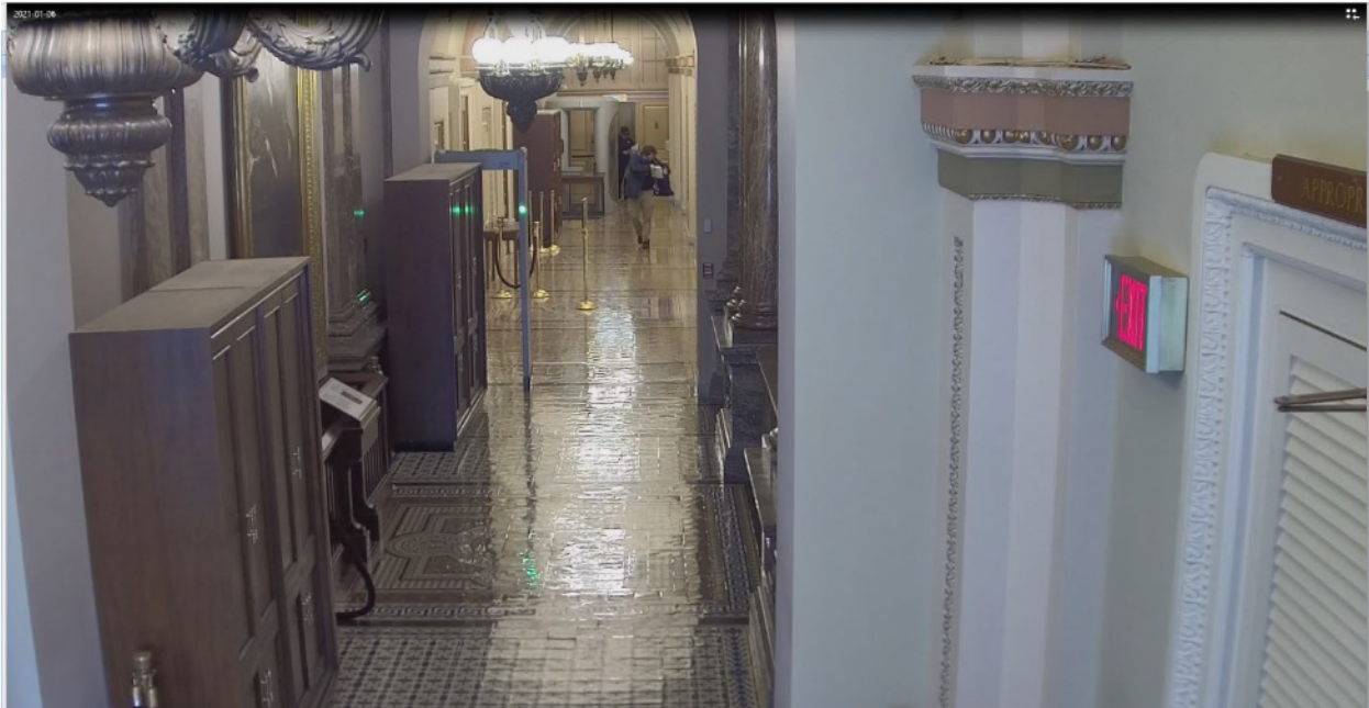
(Vukich places the papers in his jacket. Perretta is seen looking through papers from the floor.)

Perretta Messages: In the afternoon of January 6, 2021, Perretta texted someone from his phone: “We broke into the capital”. The person responded, “Pics or u cappin”. Perretta responded, “Swear on everything” and included the picture below which shows Vukich in the lower right corner.