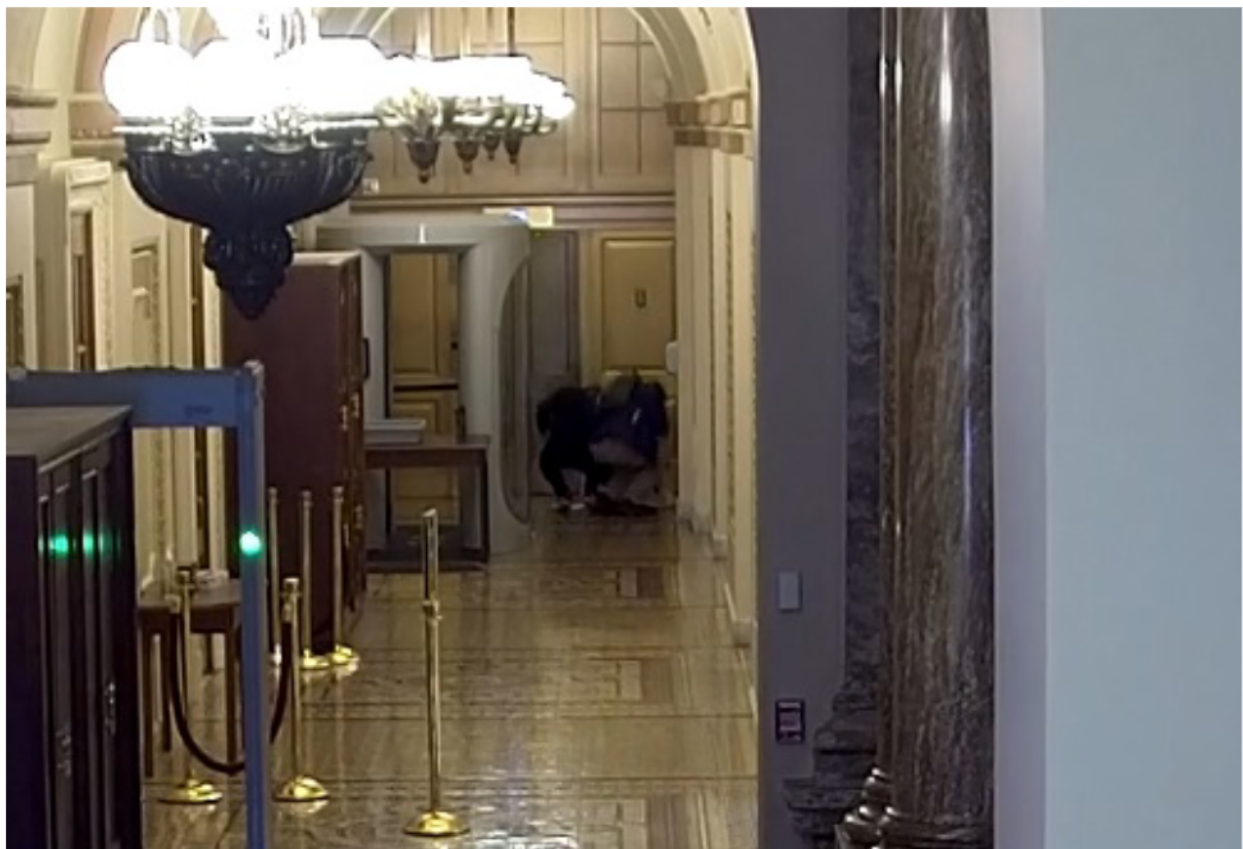
(Both defendants stoop down at the same time and each pick up papers from the floor.)