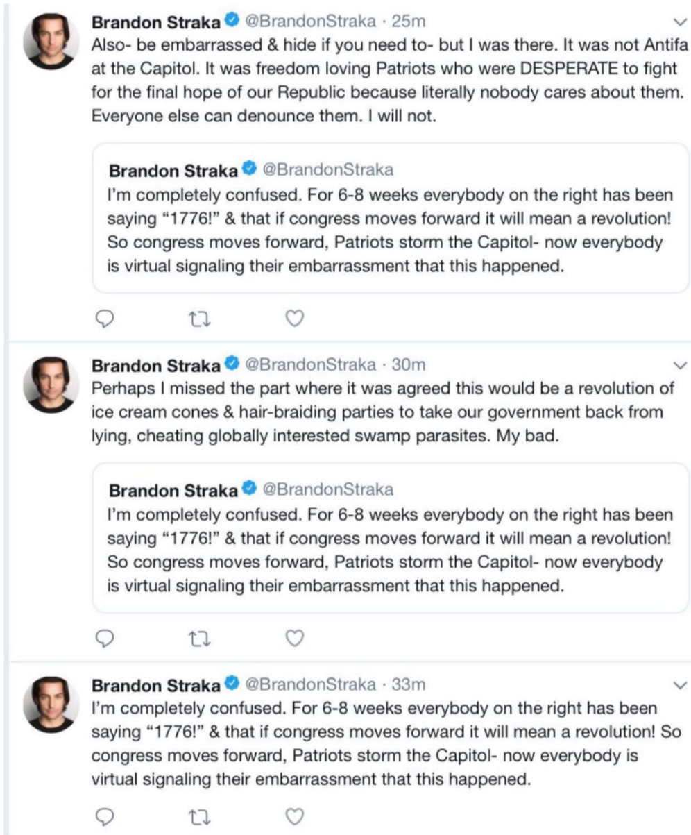
Gov. Figure F