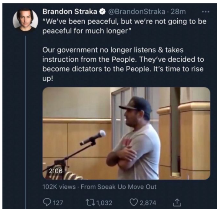
Gov. Figure C

https://twitter.com/speakupmoveout/status/1340274672768827394 (last viewed January 13, 2021). Straka’s post, which was viewed more than 100,000 times, included a message that it was time to “rise up!” Id.