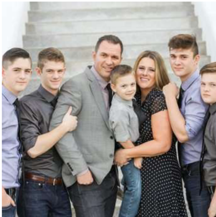
Peart Family Photo