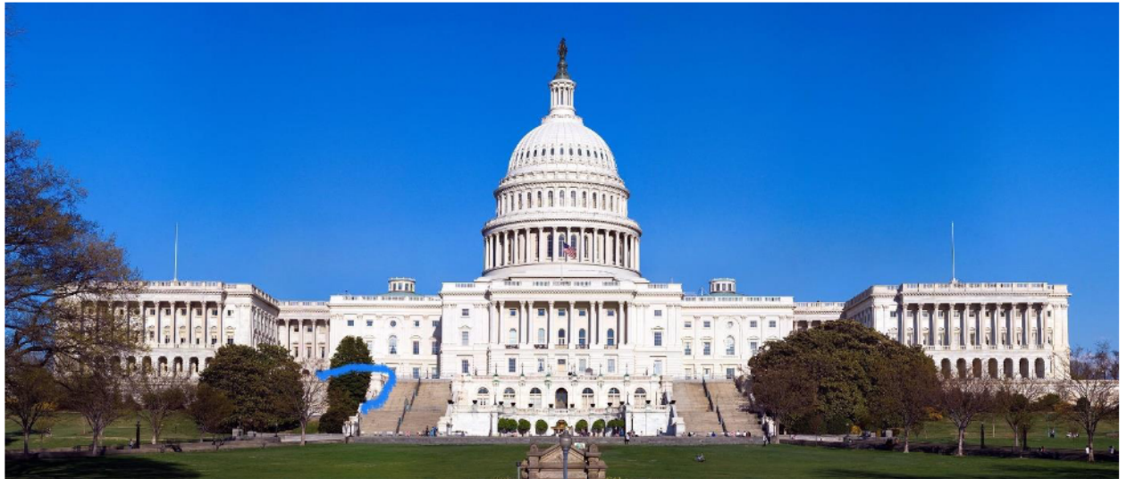
Figure C. Front view of path taken

the broad banister for a short distance then stepped down onto the stairs themselves. He walked up the stairs from there, to the terrace.