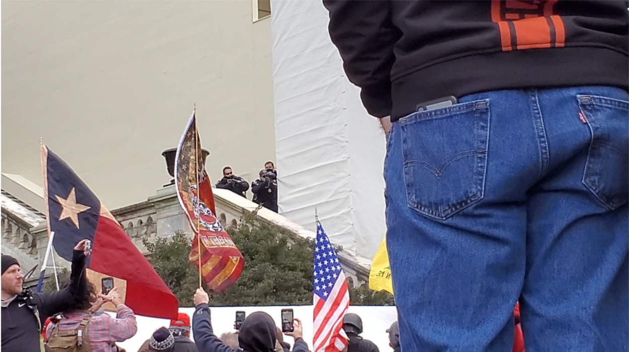
See, e.g., ECF 147, file 45 – 20210106_134746.mp4 – at 00:33 and 00:37.