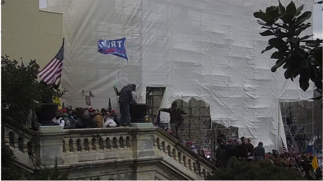
See ECF 147, file 97 – (Clip_1.1)_0924_USCG_00_ST22_Exterior_-_2021-01-06_19h16min11s – at 00:45.