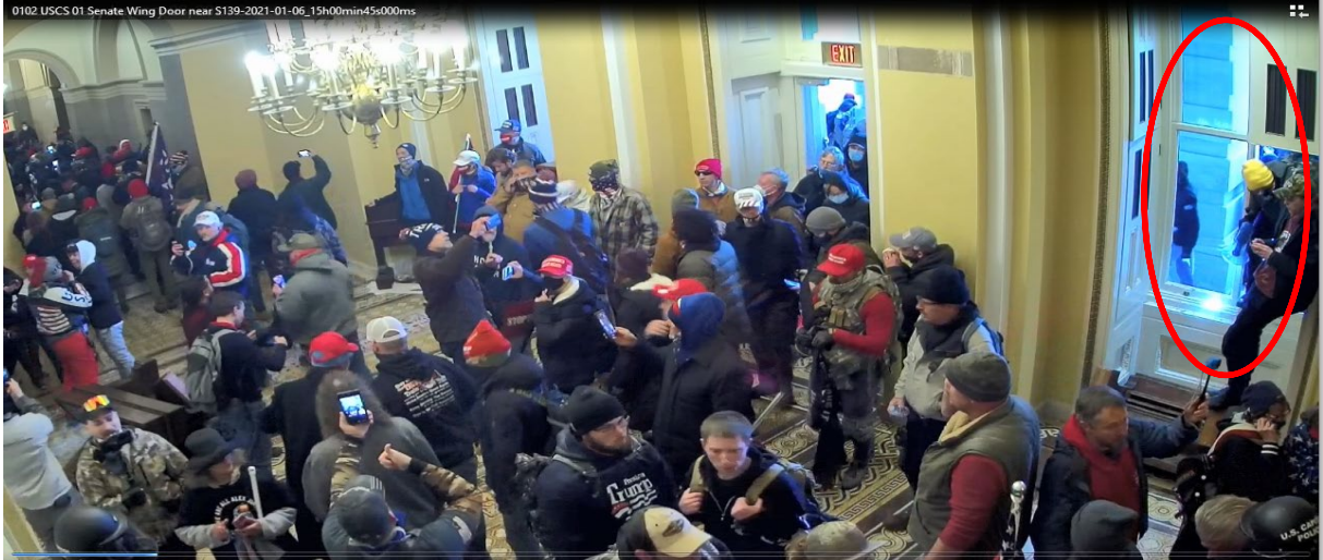
EVANS climbing through broken window.