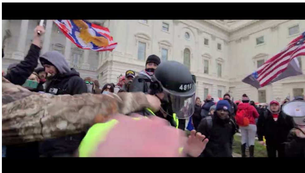
Exhibit 16 (Video Still of Exhibit 12)

At :31s in Exhibit 12, the defendant punches Officer Z.B. in the head.