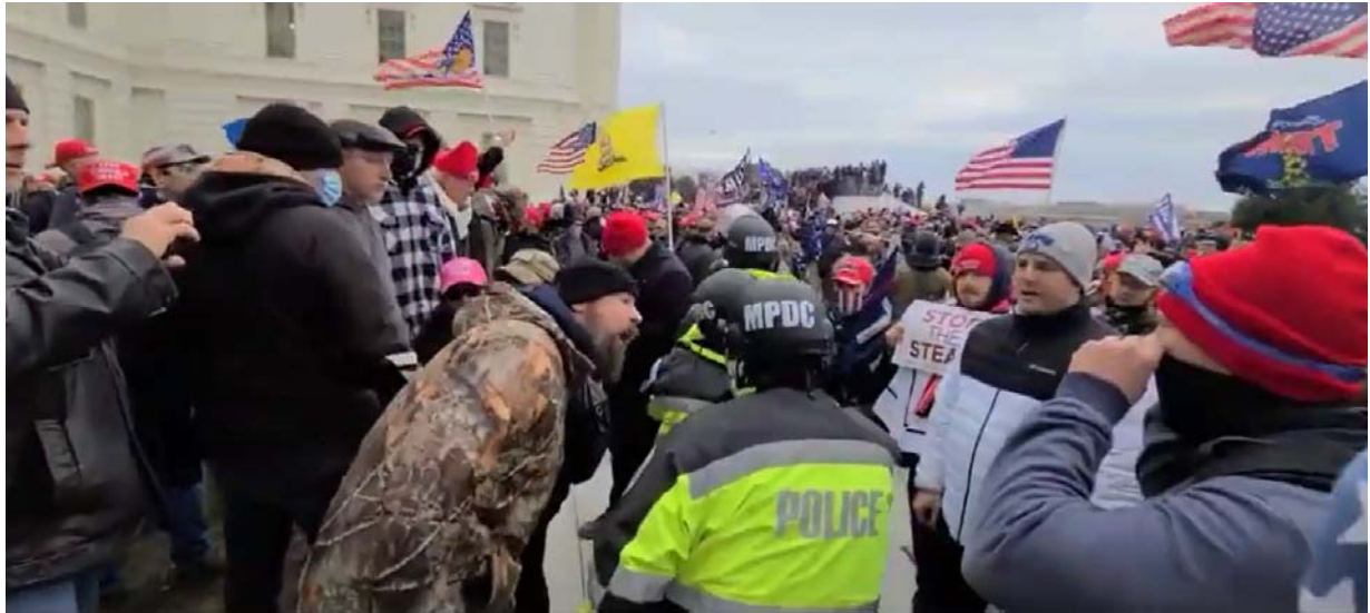
Exhibit 13 (Still from Exhibit 12)

American? Act like a fucking one! . . . You guys have no idea what the fuck you're doing!" The following is a still from Exhibit 12: