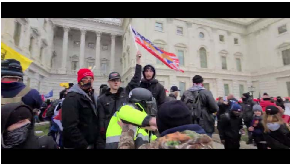
Exhibit 15 (Video still from Exhibit 12)

At :27s in Exhibit 12, the defendant can be seen shoving Officer Z.B.: