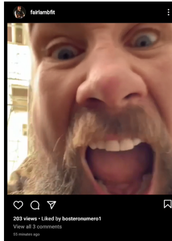
Exhibit 4 (Still from Exhibit 2)

Several minutes later, the JaydenX video shows a horde of rioters pressing past police attempting to hold the line on the West Capitol Front. The JaydenX video shows the rioters overwhelming the outnumbered police and successfully breaking through metal barricades as shown in the following video still from the JaydenX video: