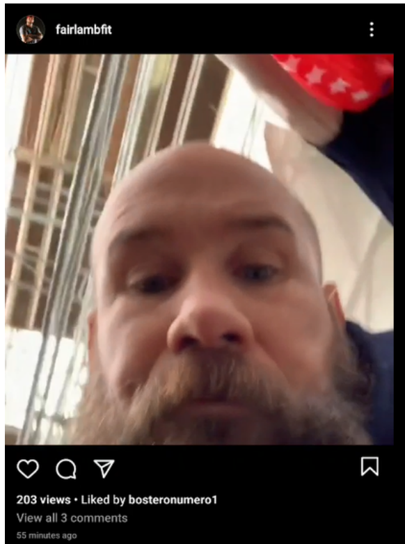
Exhibit 3 (Still from Exhibit 2)