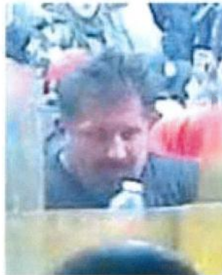
BOLO 263-AFO B

12. Based on my review of publicly available video footage and still images, USCP surveillance footage, and body worn camera (“BWC”) footage of officers that responded to the Capitol on January 6, 2021, I have observed that, at various points on January 6, 2021,