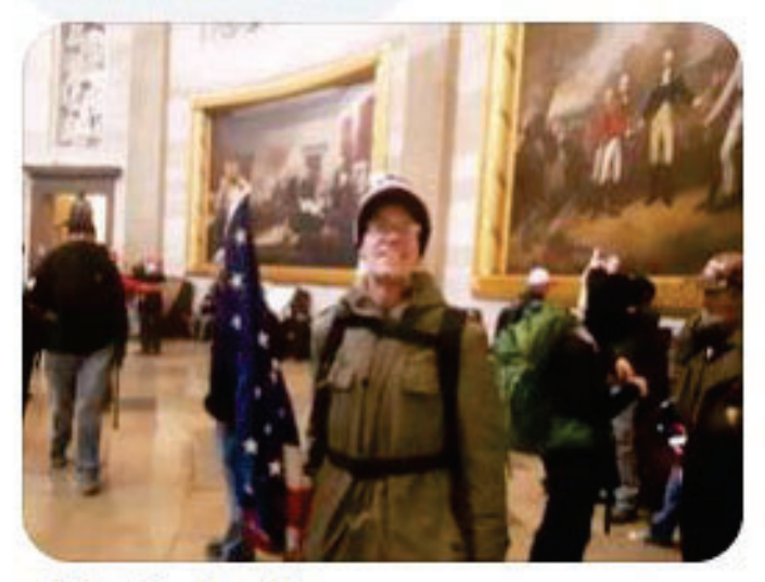
Like · Reply · 2d