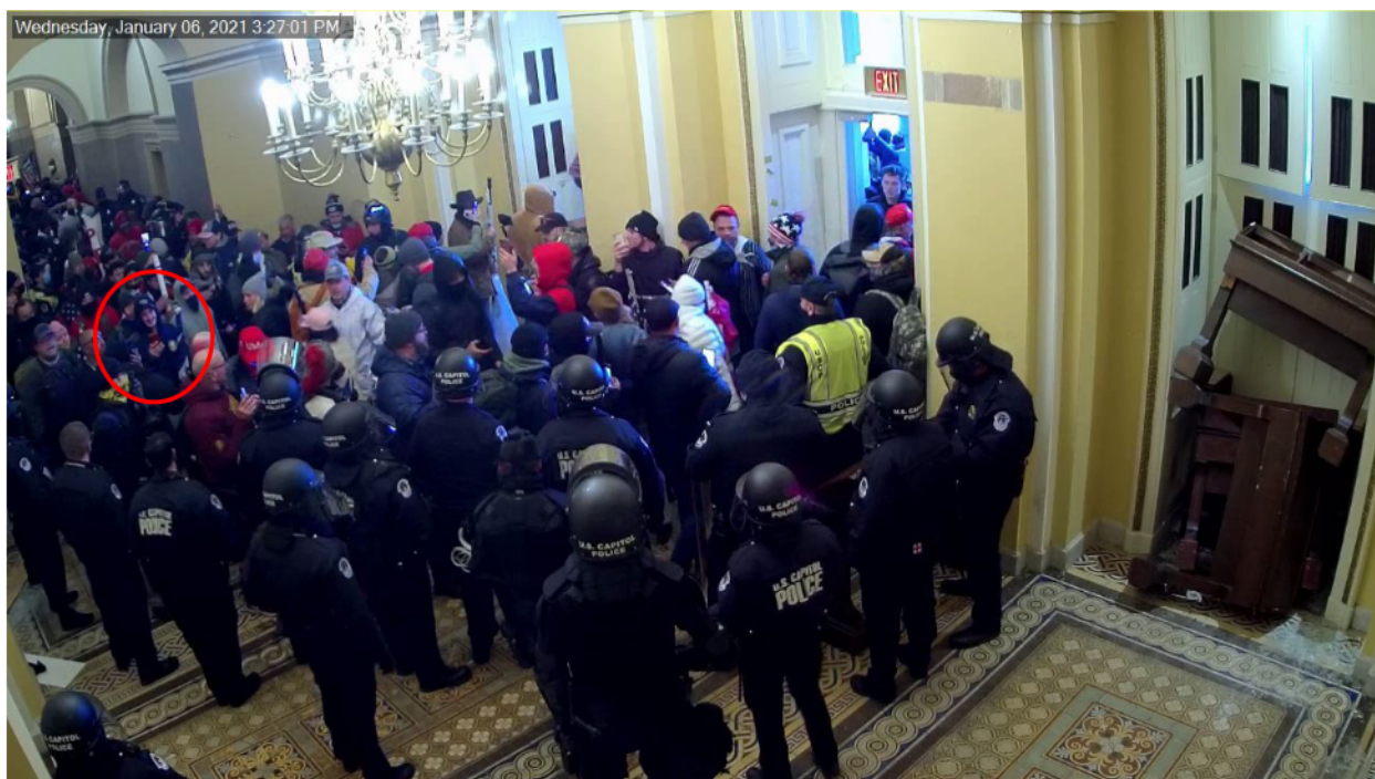
Image 2 – Colgan continued to record in the lobby of the Senate Wing Door entrance