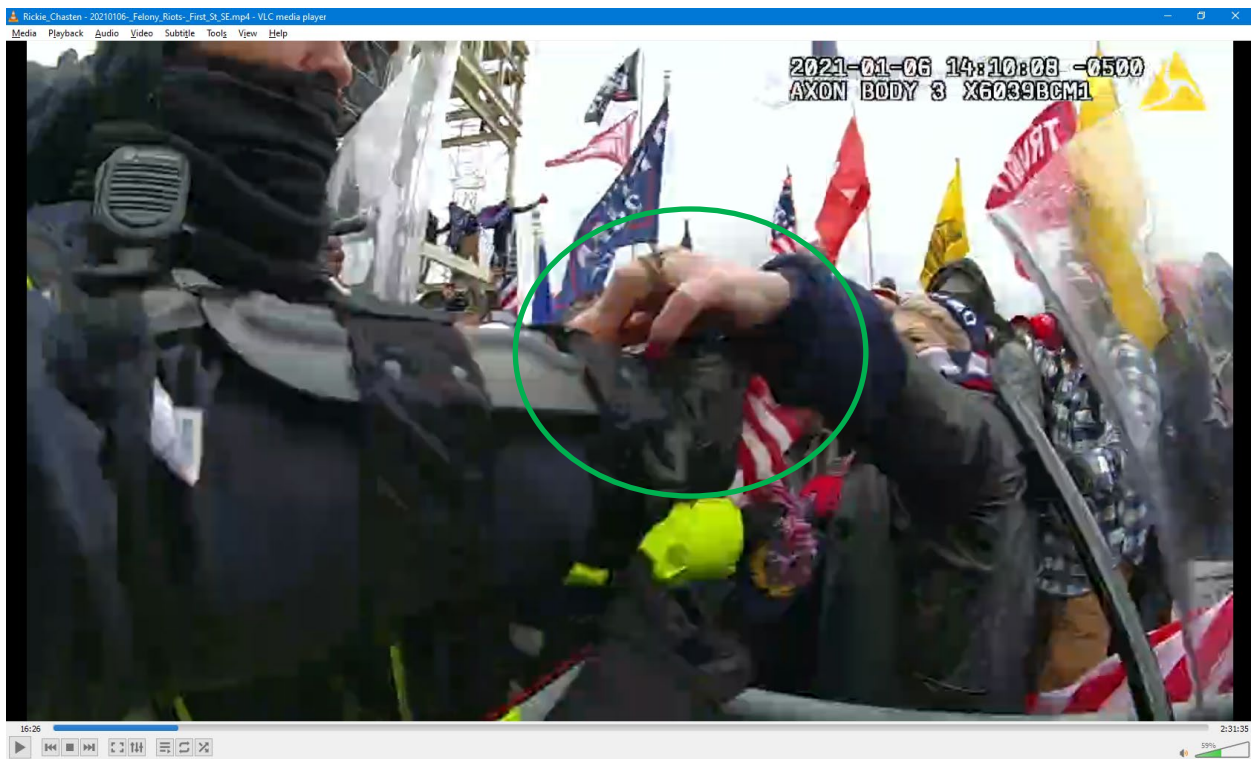
MMIDDLETON and JMIDDLETON continue grappling with and striking T.T. and R.C. as various flags are jabbed toward the officers' faces.