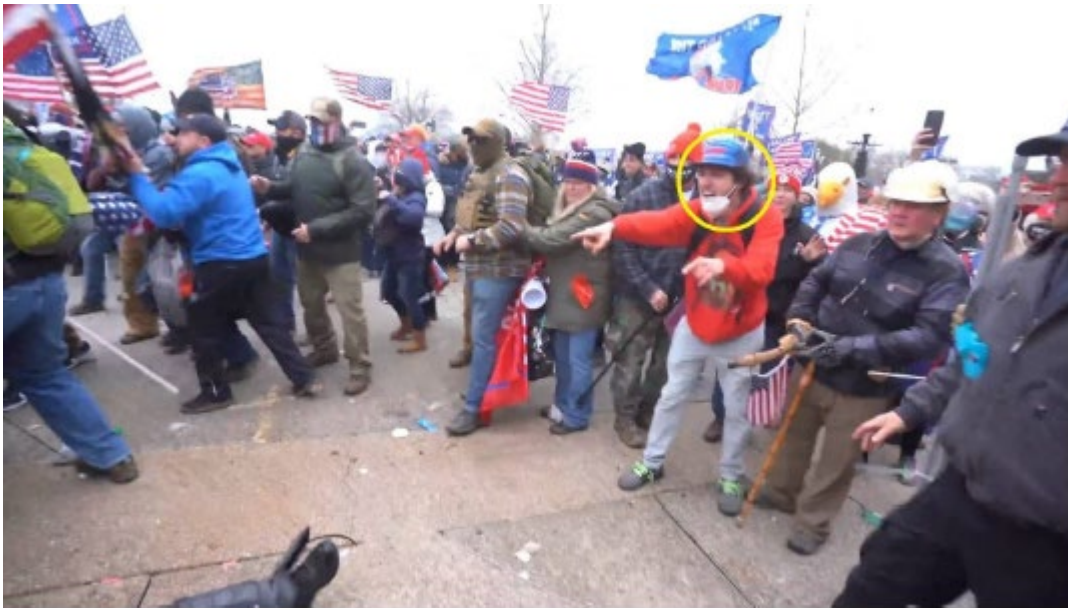
Trump Supporters Storm US Capitol - 10min22sec.mp4

Pointing and laughing when officers fall to the ground after being struck by metal chair.