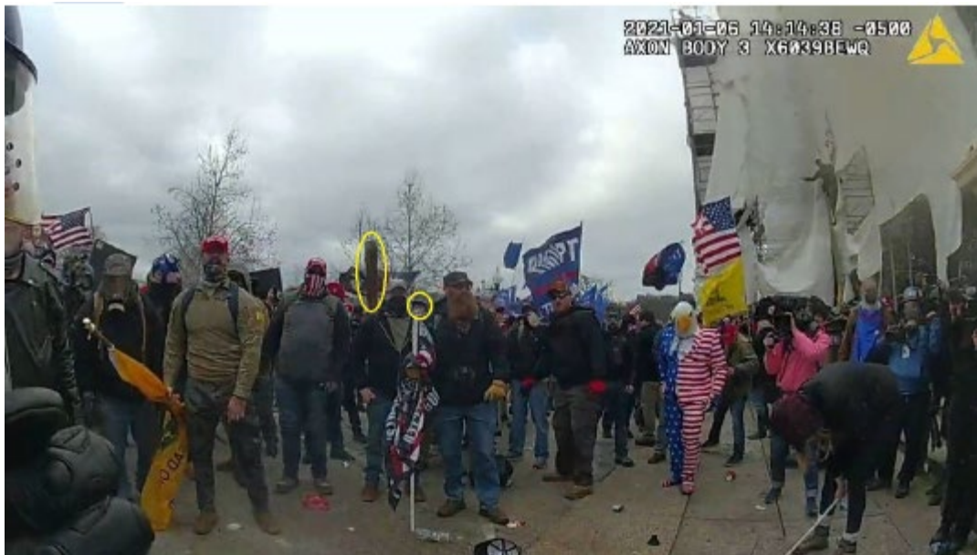
Bodycam footage from Thomas Robertson case https://archive.org/details/DZ7CnoNLN7cLMXPJr Timecode: 18:40