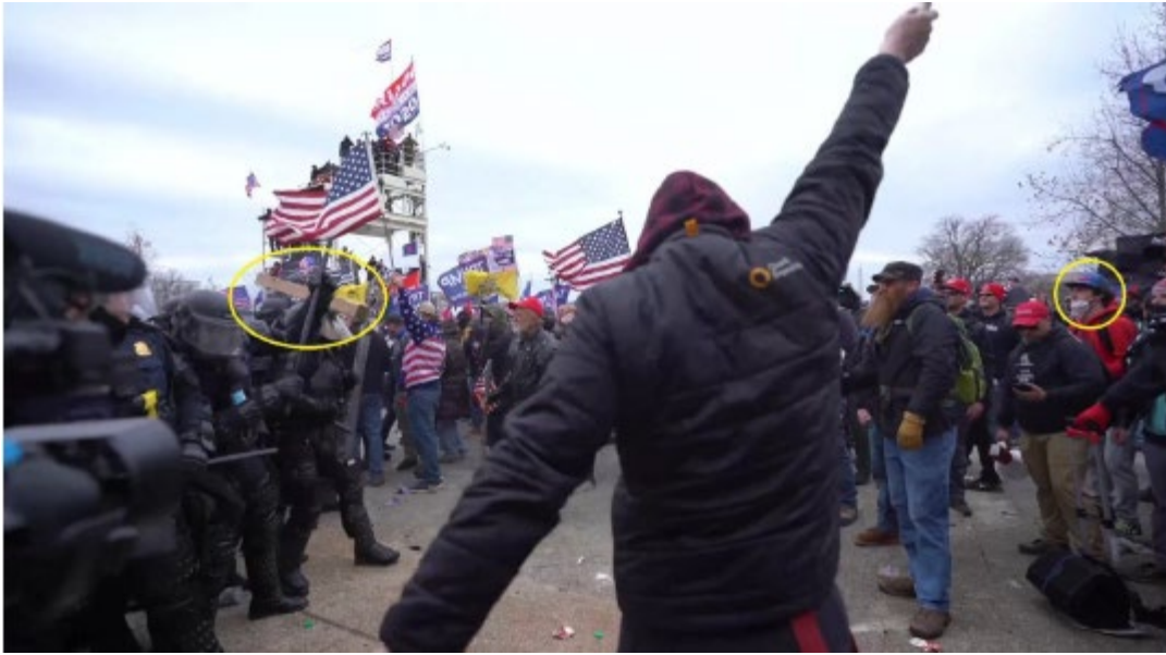
Trump Supporters Storm US Capitol - 10min22sec.mp4