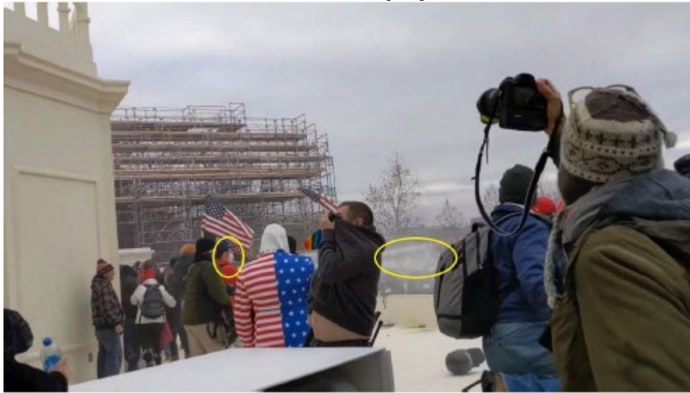
JANUARY 6 WASHINGTON, D.C. RIOT, FULL https://www.youtube.com/watch?v=AQAY5hUNhWs&t=1468 Timecode: 24:28