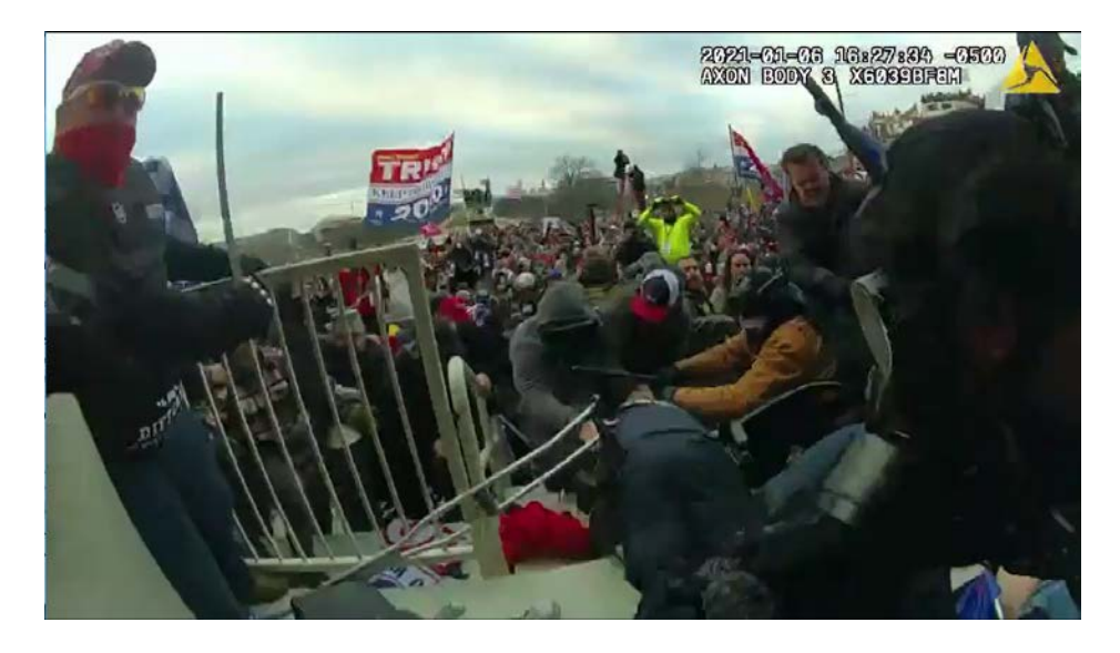
Identification of Whitton

As of January 15, 2021, unknown Twitter users created the hashtag, #Scallops, to track photographs of Whitton assaulting B.M. In the photographs tagged, Whitton is seen in various stages of dress during the assault. A tip was submitted to the FBI with a video that captured Whitton taking a video of the crowd, using his phone. The tipster described Whitton as wearing a green overcoat, thin red down coat underneath, hat with white back, navy front, red and white letters. A still photo captured from this video is seen in the photographs below.