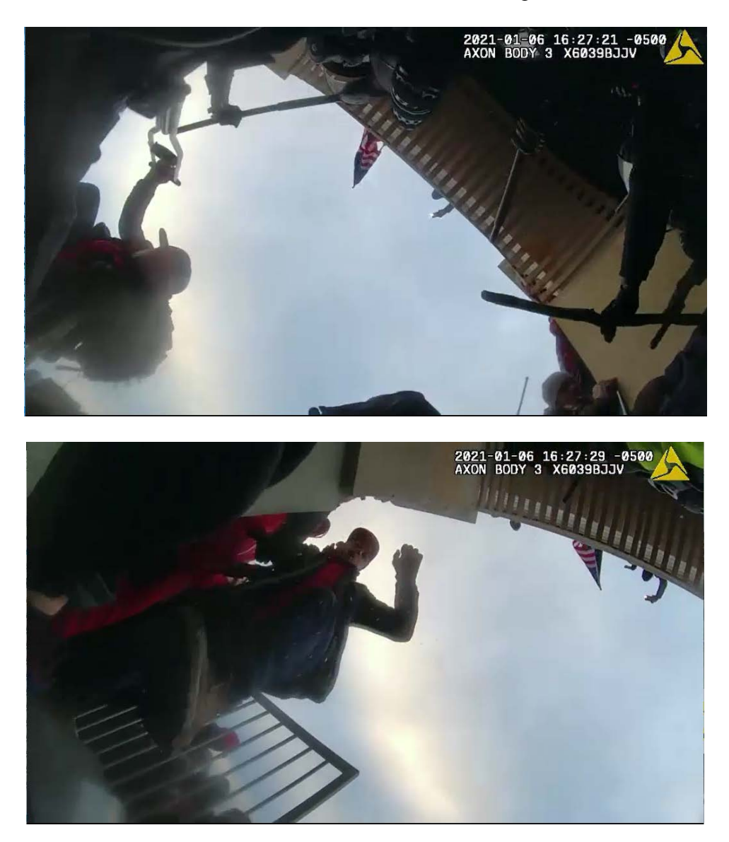
A.W.'s BWC shows that Whitton grabbed a hold of B.M.'s hands and/or baton and began pulling B.M. out of the police line, over top A.W.

A.W.'s BWC footage shows the assault from the vantage point of the ground, as Whitton attacked B.M. while he was standing next to and overtop A.W. See Exhibit 2. A.W.'s BWC shows Whitton jabbing a crutch in the direction of B.M., and then Whitton kicking at A.W.