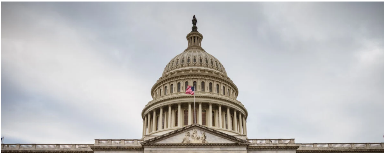
The Insurrection The Effort to Overturn the Election