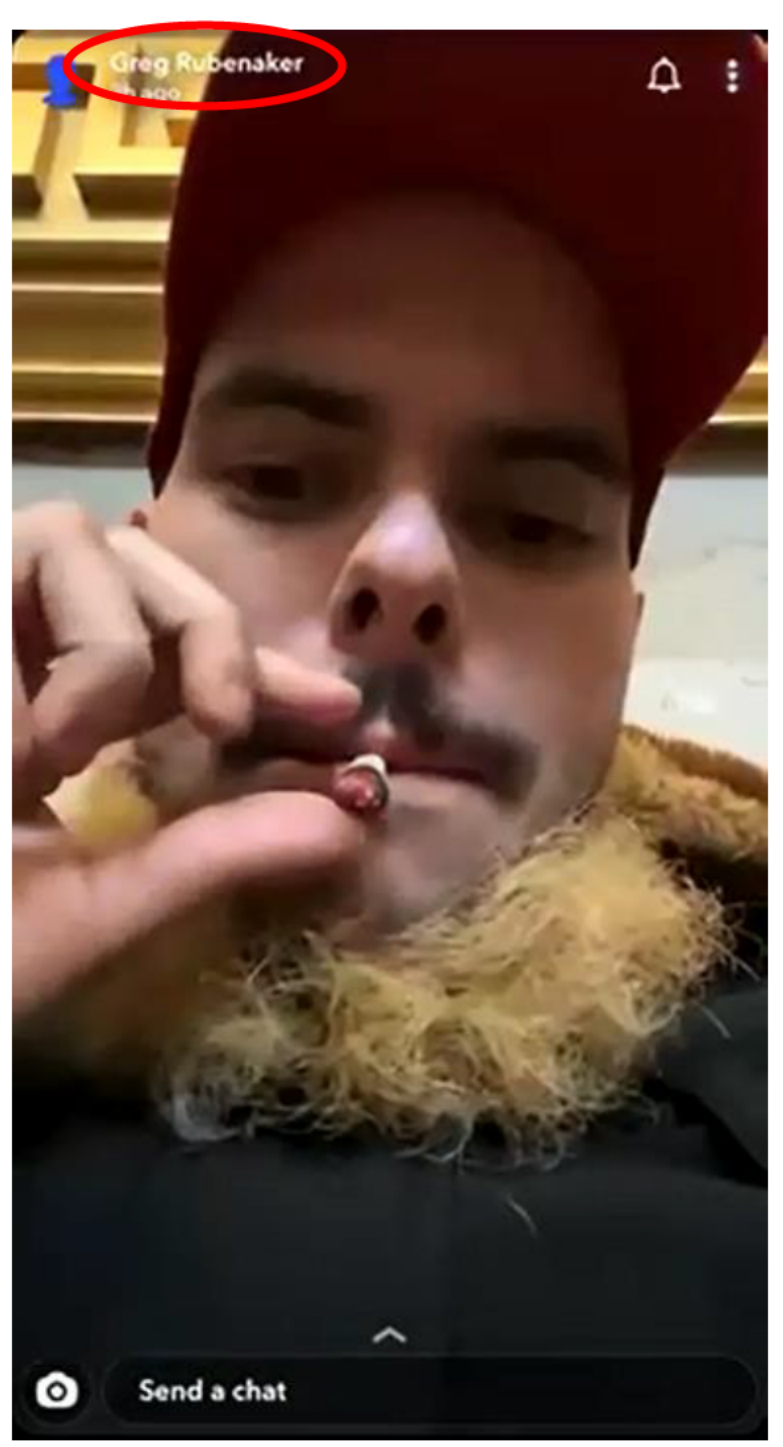
Figure Two Figure Three