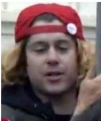
Photograph #137 - AFO