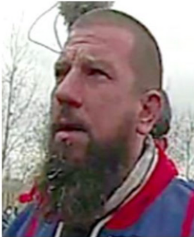
Photograph #58 - AFO