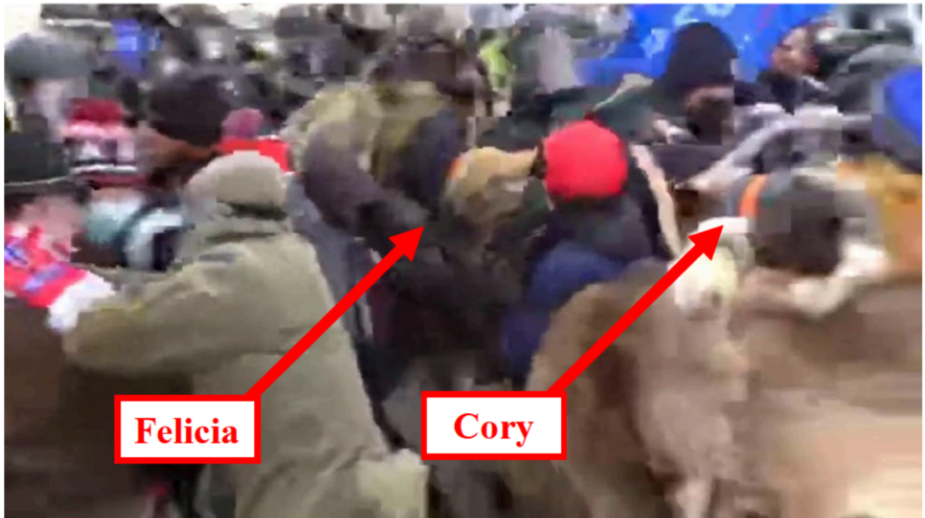
Still from Ex. 5 at 7:27

orange tape) and Cory (recognizable from his grey helmet with orange tape) in the crowd; it is necessary to watch the video in motion to apprehend what is being depicted.