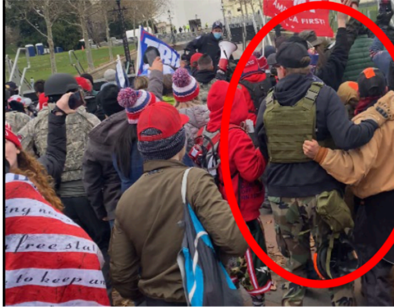
Still from Ex. 3 at 00:12

Once the crowd overpowered the officers and trampled the barricades, the Konolds followed Chrestman scrambling over a demolished snow fence and moved briskly toward the Capitol building.