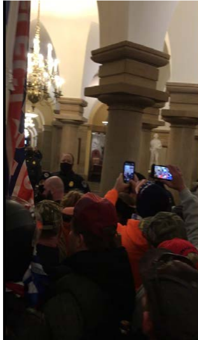
Another photograph from BAUER'S phone depicts the crowd inside the crypt: