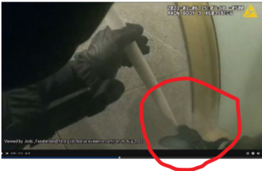
Smoke emitting from sparkler on the ground.