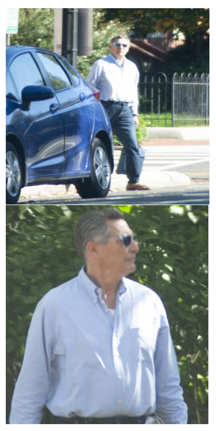
Based upon your Affiant's comparison of the driver's license photo for WALLS-KAUFMAN, to the U.S. Capitol security video and body worn camera footage, and personal observations, your Affiant is confident that WALLS-KAUFMAN entered through the Rotunda Interior door and