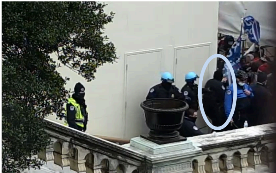
Figure 4. The officer who a rioter sprayed with chemical agent is circled in blue.