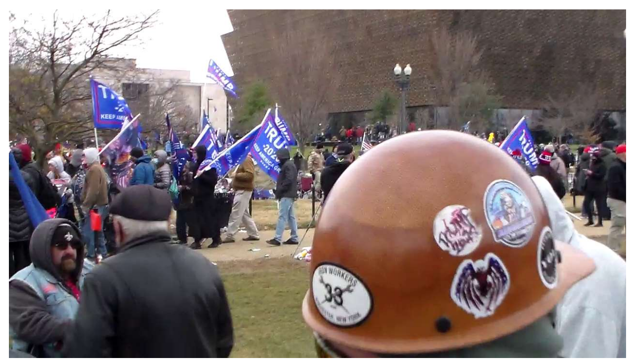
Figure 2: Mault, wearing a hardhat, before he and Mattice approached the Capitol building.