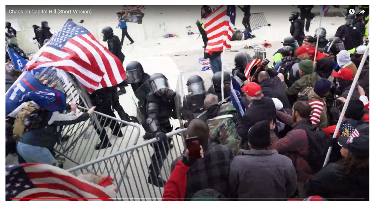
Figure 6: Seconds later, the police line collapsed. Mault and Mattice are to the right, out of frame.