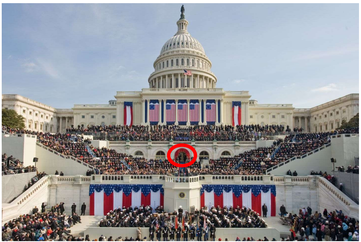
Figure 1: The Lower West Terrace tunnel, as seen on Inauguration Day

On January 6, 2021, when rioters arrived at the doors behind this archway, the outer set of doors was closed and locked, and members of Congress who had fled from the rioters were sheltering nearby. Members of the United States Capitol Police ("USCP"), assisted by officers from the District of Columbia Metropolitan Police Department ("MPD"), were arrayed inside the doorway and guarding the entrance. Many of these officers already had physically engaged with the mob for over an hour, having reestablished a defense line here after retreating from an earlier protracted skirmish on the West Plaza below.