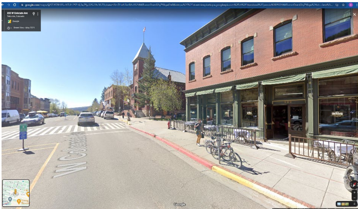
Photo 3 - Google maps - street view of Colorado Avenue in downtown Telluride, CO